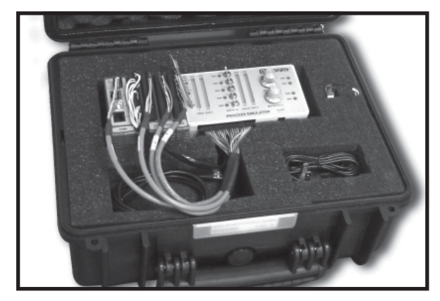
Figure 3: MAQ20 Demonstration Suitcase