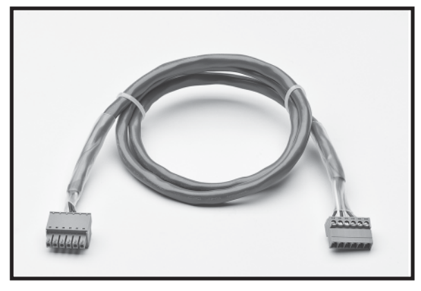
Figure 2: Backbone Expansion Cable