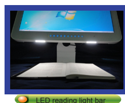
LED reading light bar