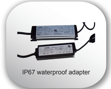
IP67 waterproof adapter