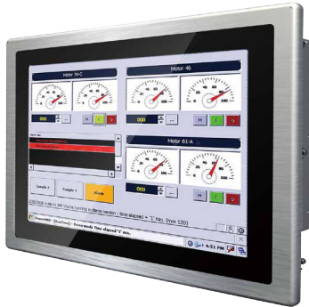
Real Flat Panel Mount (IP65 front side)