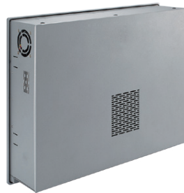
▲ Back view