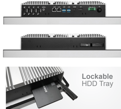
Lockable HDD Tray