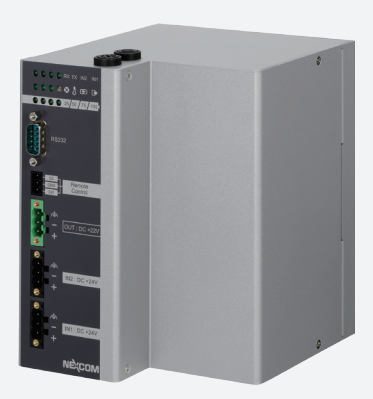
NISKBAT3 Power Pack