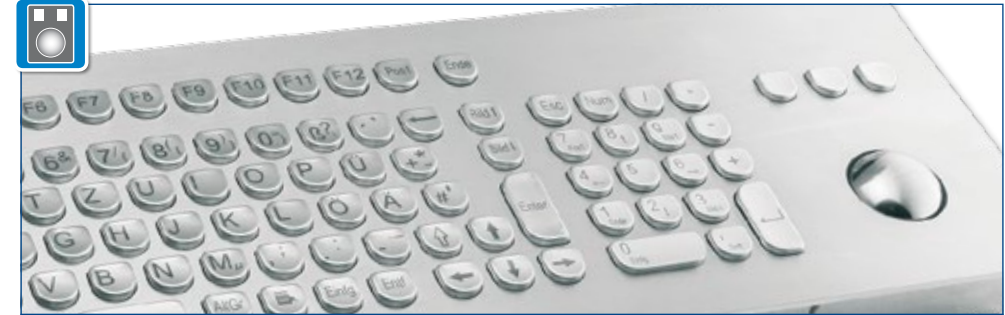
TKV-105-TB38V-MODUL with integrated 38-mm trackball