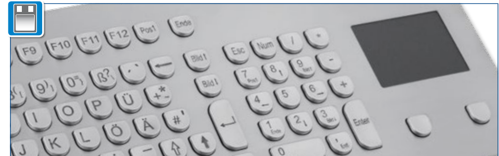
TKV-105-TOUCH-MODUL with integrated touchpad